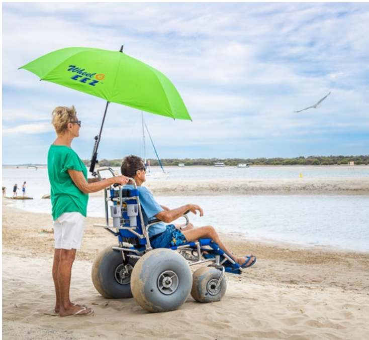
SANDCRUISER® ALL-TERRAIN CHAIR