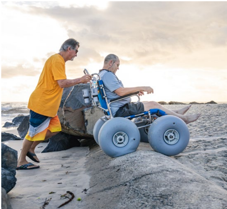
SANDCRUISER® DUNE BUSTER